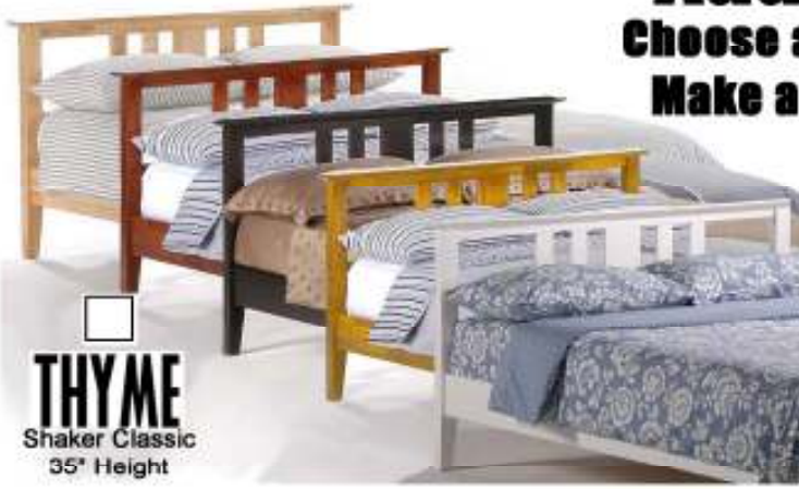
THYME Shaker Classic 35" Height