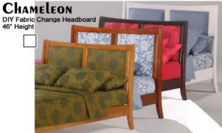
CHAMELEON DIY Fabric Change Headboard 46" Height