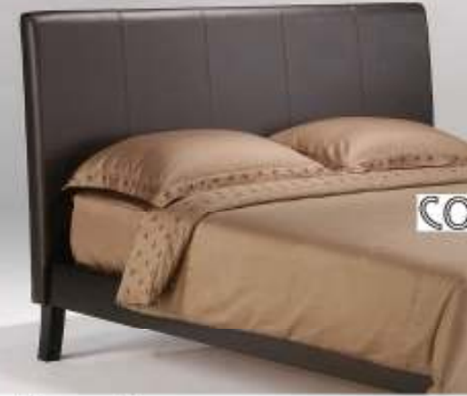
Art Nouveau 46" Height CORIANDER

Your Headboard is more than a functional piece of furniture. You can Kick Back in comfort or Kick Up the design of your bedroom.