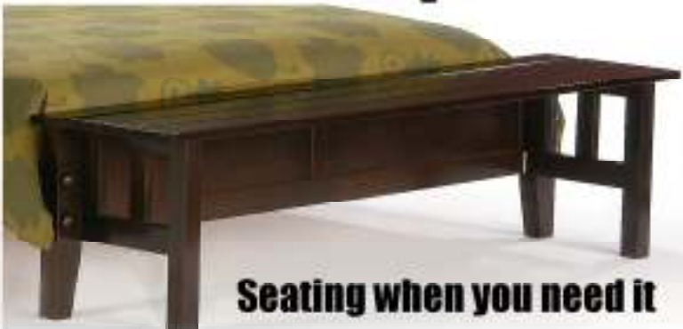
Seating when you need it