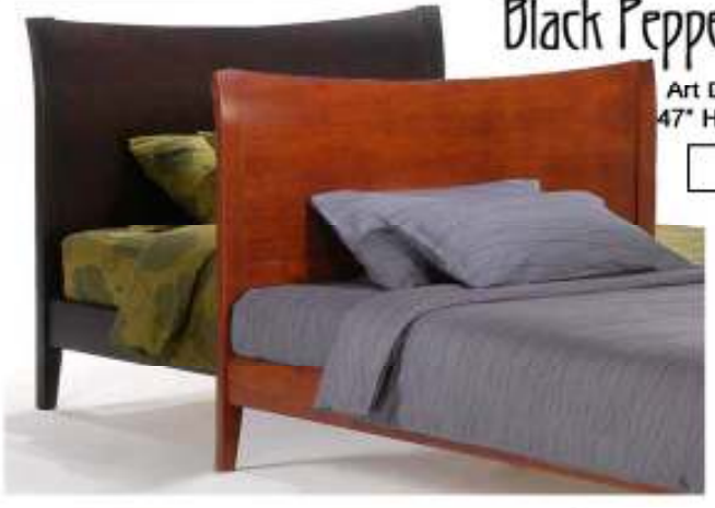
Black Pepper Art Deco 47" Height