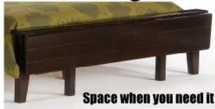
Space when you need it