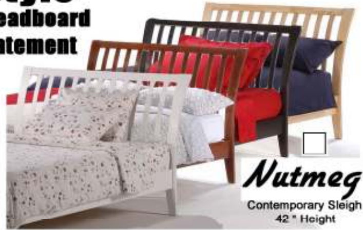
Nutmeg Contemporary Sleigh 42" Height