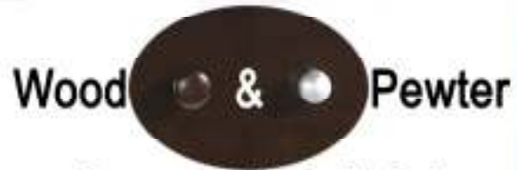
Wood & Pewter