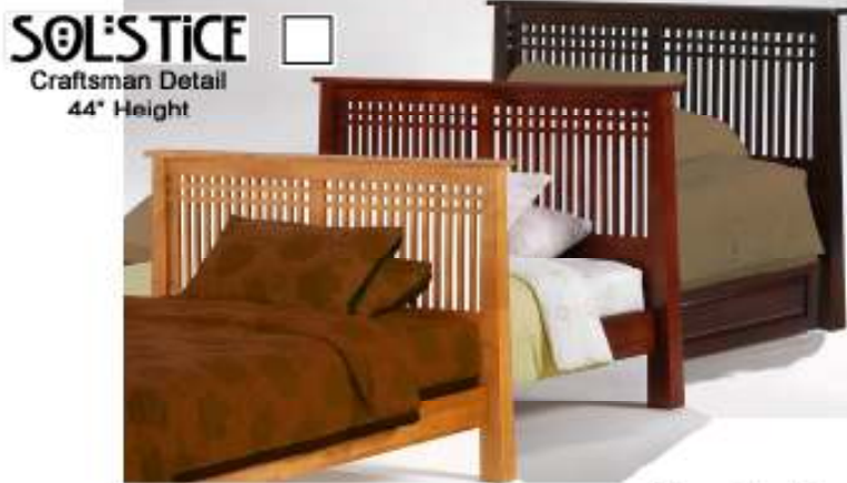
SOLSTICE Craftsman Detail 44" Height